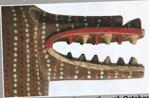
Don't miss Tribal Craft, now through October.

Robert V. Fullerton Art Museum, California State University San Bernardino from October 9, 2010 - February 13, 2011 For more information visit http://museum.csusb.edu .