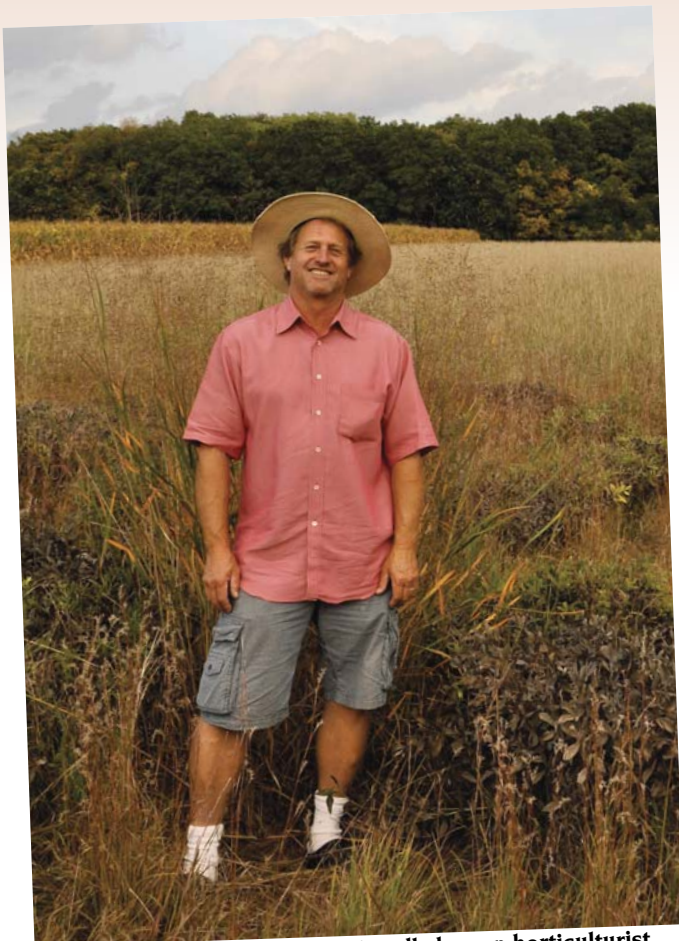
John Greenlee, an internationally known horticulturist and PBS host to speak during Garden Days 2010.

on water conservation, Trees and Shrubs for Dry California Landscapes , in 1981. His second publication, Landscape Plants for Western Regions , received an ASLA National Merit Award in 1994. His latest book, Landscape Plants for California Gardens (March 2010), an illustrated reference, is already destined to be a classic. There will be a book signing after the lecture.