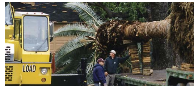
A big palm that stood on the old grove is being hoisted on a truck for the move to the new site in 2001.