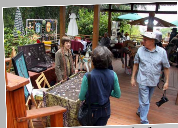
Summer Artisans' Sale coming June 2.

June 9 Craft in America Reception For more information, please call (909) 980-0412.