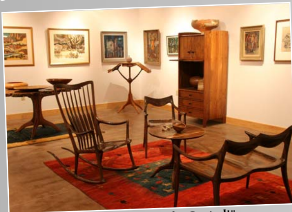
Don't miss "Please, be Seated!" April 8 through October 28.

April 8 – October 28 Please, be Seated! Noon – 4 pm