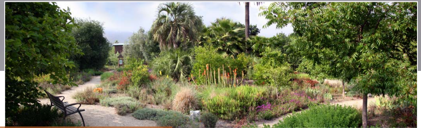
Maloof Discovery Garden

The exhibition was inspired by feedback from visitors who expressed delight upon encountering the existing sculptures in the garden, many of which are whimsical or kinetic. More than 40 sculptures will be on display during the course of the exhibition.