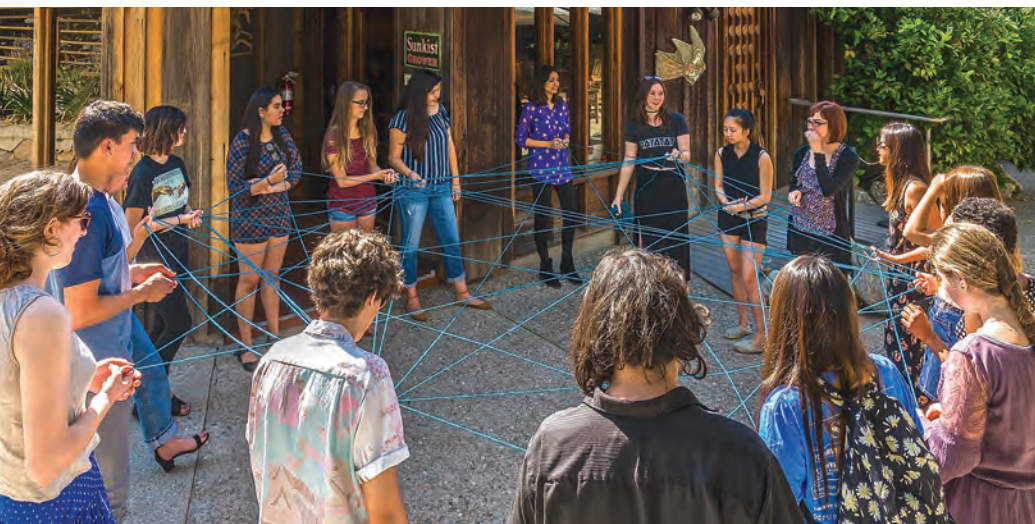
Maloof Teens guide activities for visiting students during Getty Multicultural Intern Day.