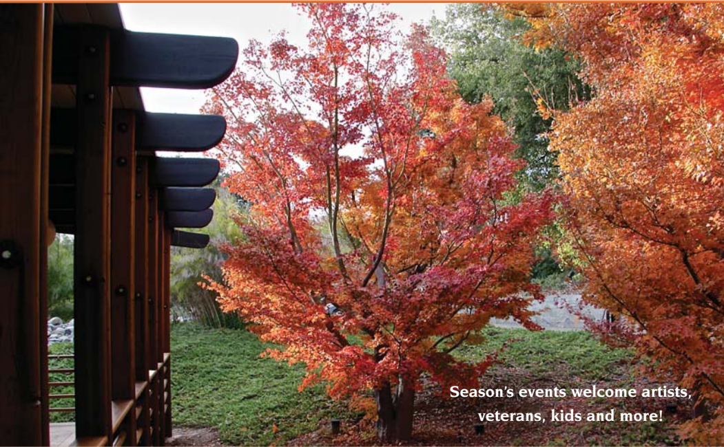
Season's events welcome artists, veterans, kids and more!