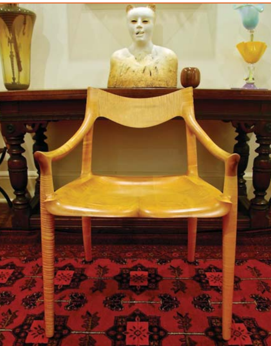
Classic Maloof arm chair from a private collection in Atlanta is listed on the Registry, but many others have yet to be located.