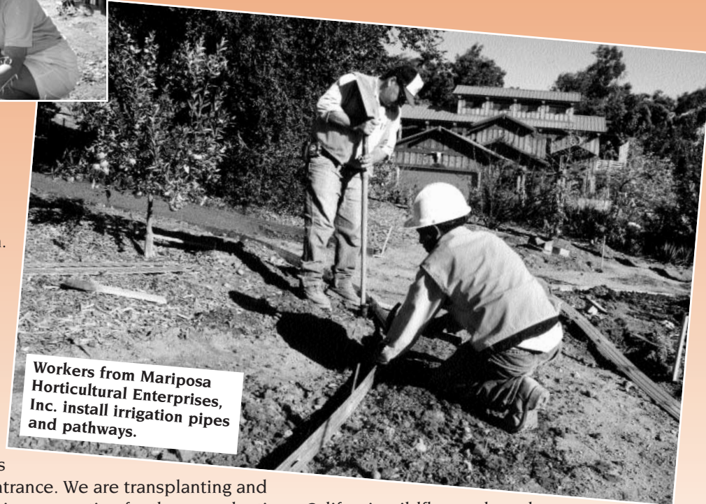
Workers from Mariposa Horticultural Enterprises, Inc. install irrigation pipes and pathways.

Progress has been made in the garden! With a $100,000 gift we have begun work on the implementation of the master plan. Mariposa Horticultural Enterprises, Inc. has installed an irrigation system for water-wise landscaping. Under the direction of Rick Fisher of Toyon Horticultural, ways have been found to preserve the original old oak trees on the south and west sides of the Hidden Farm entrance. We are transplanting and pruning some plants and trees in preparation for the new plantings. California wildflowers have been pruned. In February the stone fruit trees will be pruned and new plants planted. Plan a visit to this "discovery" garden grow. We are planning a garden tea party in late spring to mark the opening of the garden to the public. Contact me if you wish to work on the garden project or know of individuals or foundations that would like to provide funding for the completion of the garden. (P.S. Rick says $3 buys a new plant.)