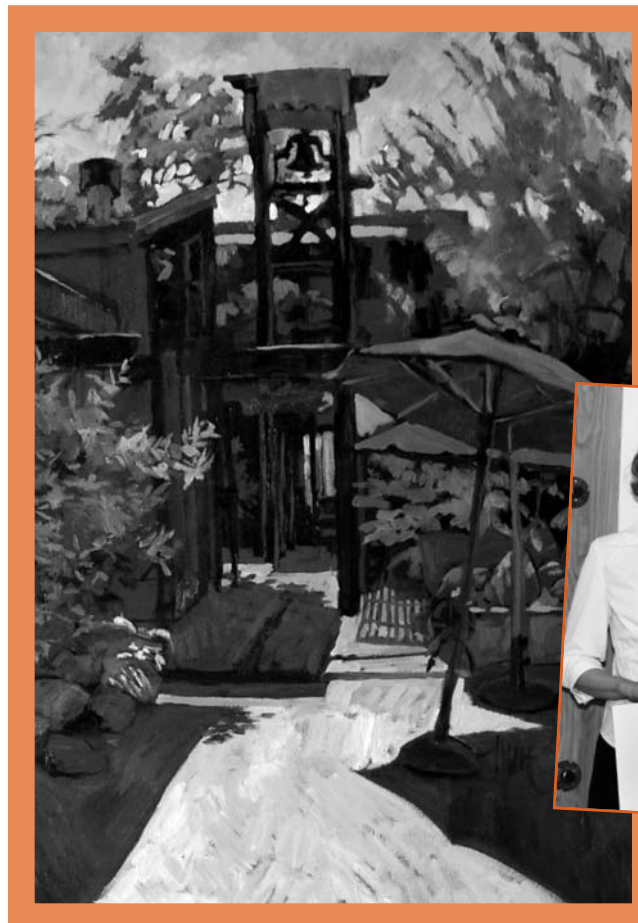
Detail from Blue Umbrella , a Plein Air painting by Durre Waseem, focuses on the entryway to the museum-house. The painting received a second place award.

Plein Air , an exhibit utilizing the Foundation site as the subject matter, ran through September at the Jacobs Center. En plein air is a French expression which means "in the open air" and is particularly used to describe the act of painting outdoors. The French, who originated it were especially interested in the influence of changing light outdoors on color.